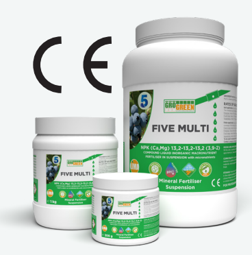
Packing size 200g, 1kg, 5kg