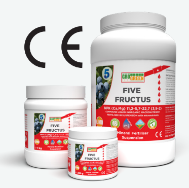
Packing size 200g, 1kg, 5kg