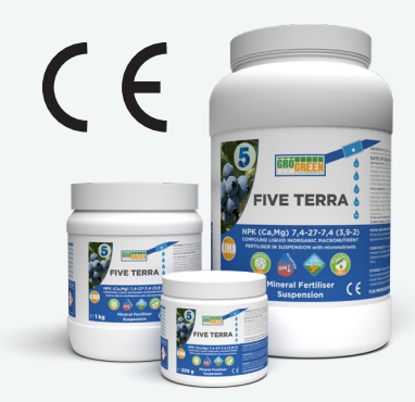
Packing size 200g, 1kg, 5kg